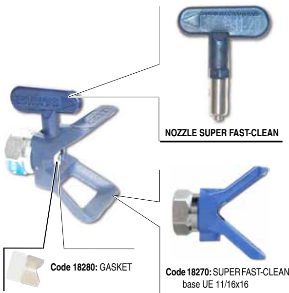
NOZZLE SUPER FAST-CLEAN